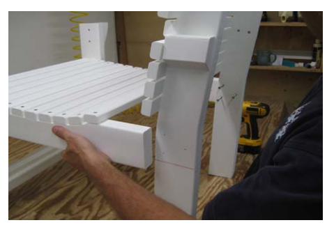
<u>Step 3,4:</u>: Place on side, use match lines to position and run the screws in until snug, do not overtighten.