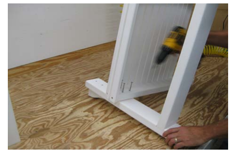
<u>Step 1.2:</u>: Match up the arrows to attach the front brace to the two side sections. Note the direction arrows.