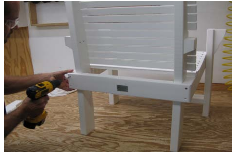
Step 5 & 6:: Line up the back seat to back sections and back brace.